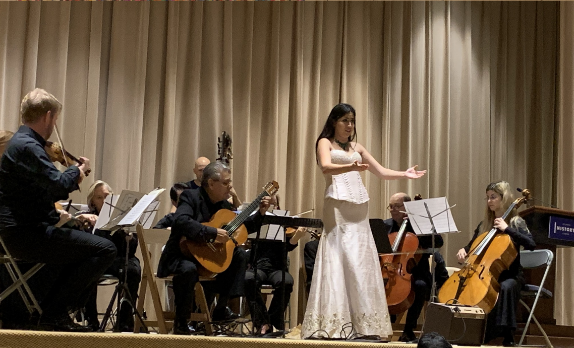
Dia de los Muertos Atlanta History Center