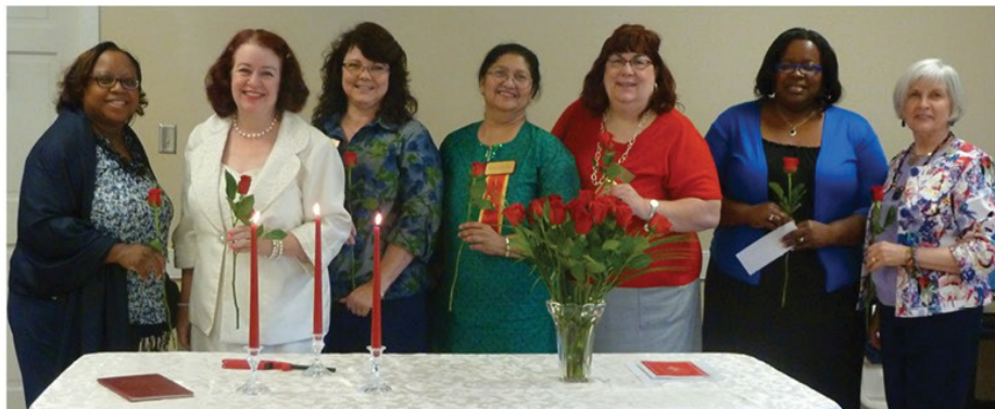
2014-2015 Alpha Iota Officers