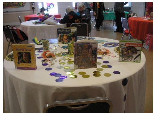
"Mardi Gras 2022"