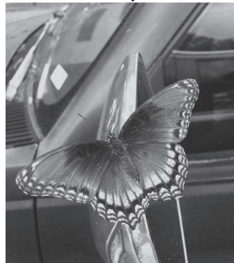
Cheryl L. Goff's photograph, Soaking up the Sun , is one of current exhibit items in the DKG Gallery of Fine Arts.

This is the first exhibit that addresses The Butterfly Effect theme. There will be one more exhibit